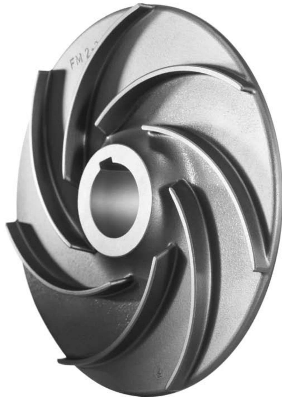
Impeller from the Fristam FM